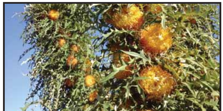
ABOVE: Dryandra nobilis