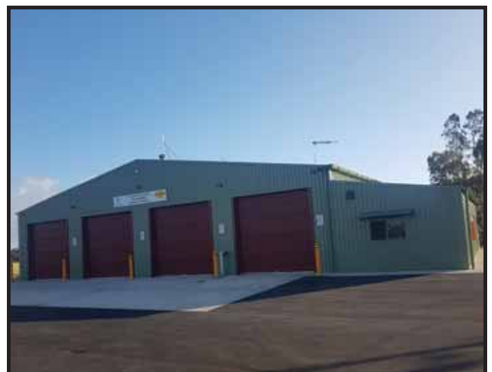
ABOVE: The new Tailem Bend Fire Service Station.

There will be an official opening held at some point over the next 12 months once we are settled in and when conditions allow.