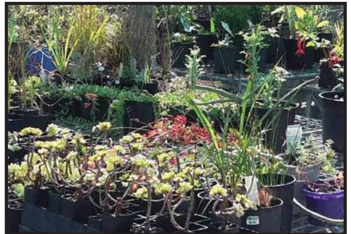
ABOVE: Plant Sale at a former plant nursery for people who have lost their gardens to bushfire in SA.

The group is made up of volunteers who collect seed, plants, garden equipment, ornaments, and pots to donate to these families so they can get back in the garden as soon as possible. They have been doing this work for many years and were responsible for helping people after bushfires in South Australia in the past, such as the Pinery and Sampson Flat fires. Volunteers are divided into several groups such as seed collectors, growers, collection points and transportation.