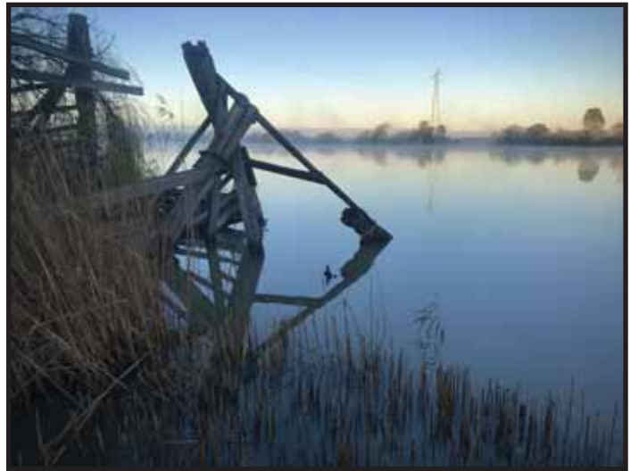
ABOVE: Dickson Reserve old TB Ferry