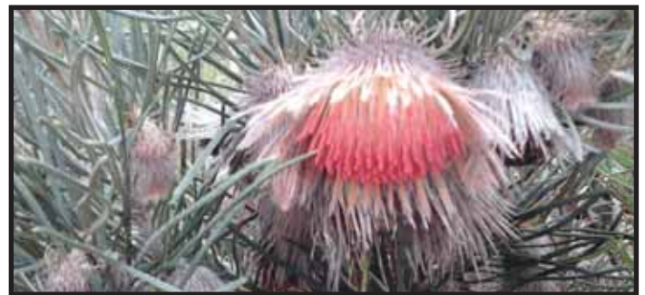
ABOVE: Dryandra speciosa

Worth the walk to see some of the hidden beauty's flowering out there at present.