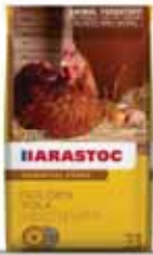
Golden Yolk Layer Pellets 20Kg