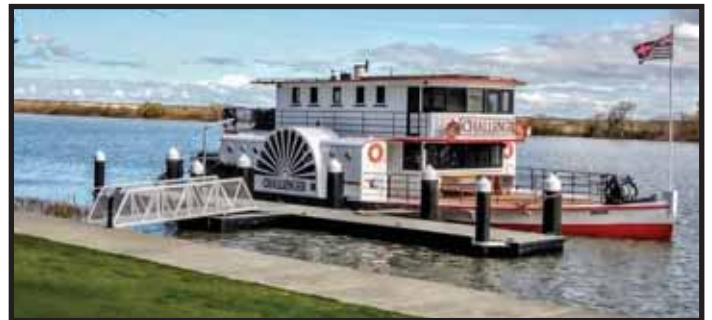
ABOVE: Dickson Reserve Pontoon at Tailem Bend attracted the paddleboat Challenger, all the way from Swan Hill, Victoria.