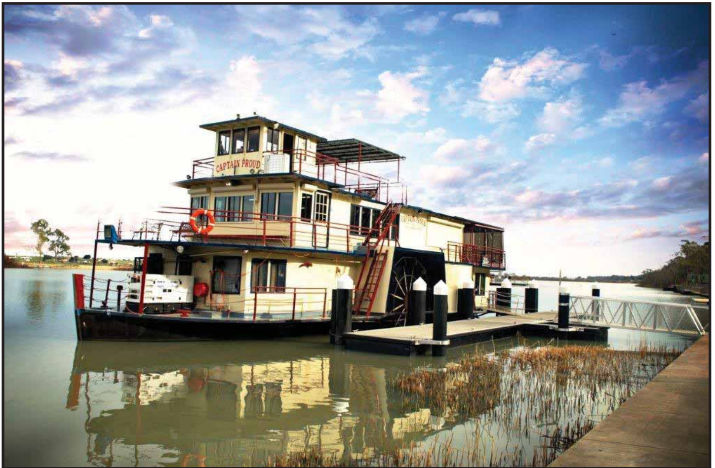
'Captain Proud' moored at Tailem Bend's new floating pontoon.